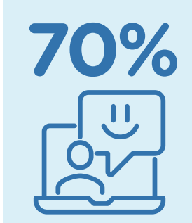
of retailers think consumers will be more understanding of any stock delays and shortages